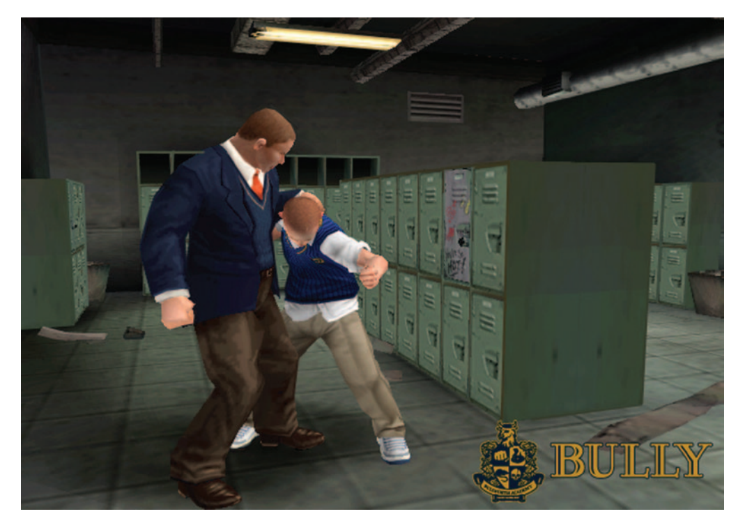
Figure 8 Although many critics though Bully was a celebration of schoolyard harassment, it is a model of the social politics of high school more than a hazing sim.

Even if the player struggles to steer Jimmy away from trouble, it catches up to him thanks to the petty malevolence of his peers. Students mill in the quad and buildings, either verbally and physically abusing each other or receding from verbal and physical attacks. Staying out of the way of the bullies (bullies in the game conveniently have their own clique, and all wear the same clothes) allows a player to avoid tussles. If a player stands in front of the wrong locker, he or she should expect to get shoved out of the way (see figure 8). Bully models the social environment of high school through an expressive system of rules, and makes a procedural argument for the necessity of confrontation. Confronting bullies is not a desirable or noble action in the game, but it is necessary if one wants to restore justice. The game privileges the underdogs—nerds and girls—and the player spends most of his time undermining the bullies and the jocks in order to even the social pecking order.