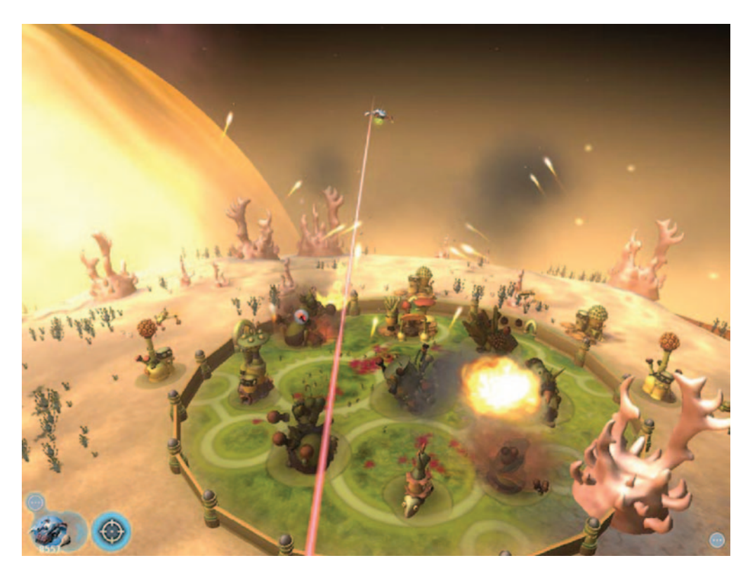
Figure 9 Spore advances a perspective on the development of planetary life by simulating a theory from astrobiology.