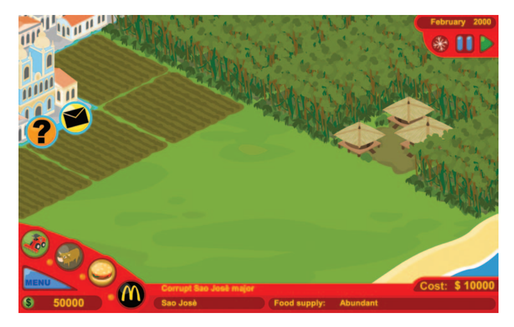
Figure 3 The player of the McDonald's Videogame makes ethical and material choices about third-world farming and governance.

dismantle indigenous settlements to clear space for grazing. These tactics correspond with the questionable business practices the developers want to critique.