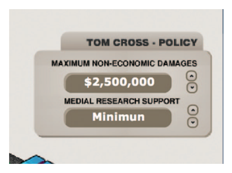
Figure 6 Levers allow the player to make simple policy.

candidates' positions on tort reform were partially motivated by the potential reduction in insurance rates such changes would encourage. The game provides a "policy panel" that allows the player to change simple public policy settings for the game environment (see figure 6). In this case, the player could alter maximum noneconomic damages awarded in medical malpractice lawsuits as well as investment in medical research to prevent repeat tragedies. In the medical malpractice subgame, maintaining a high threshold on noneconomic damages keeps insurance rates high, which is likely to cause doctors to leave the state. Once this happens, the medical office dims and the player can no longer treat citizens there.