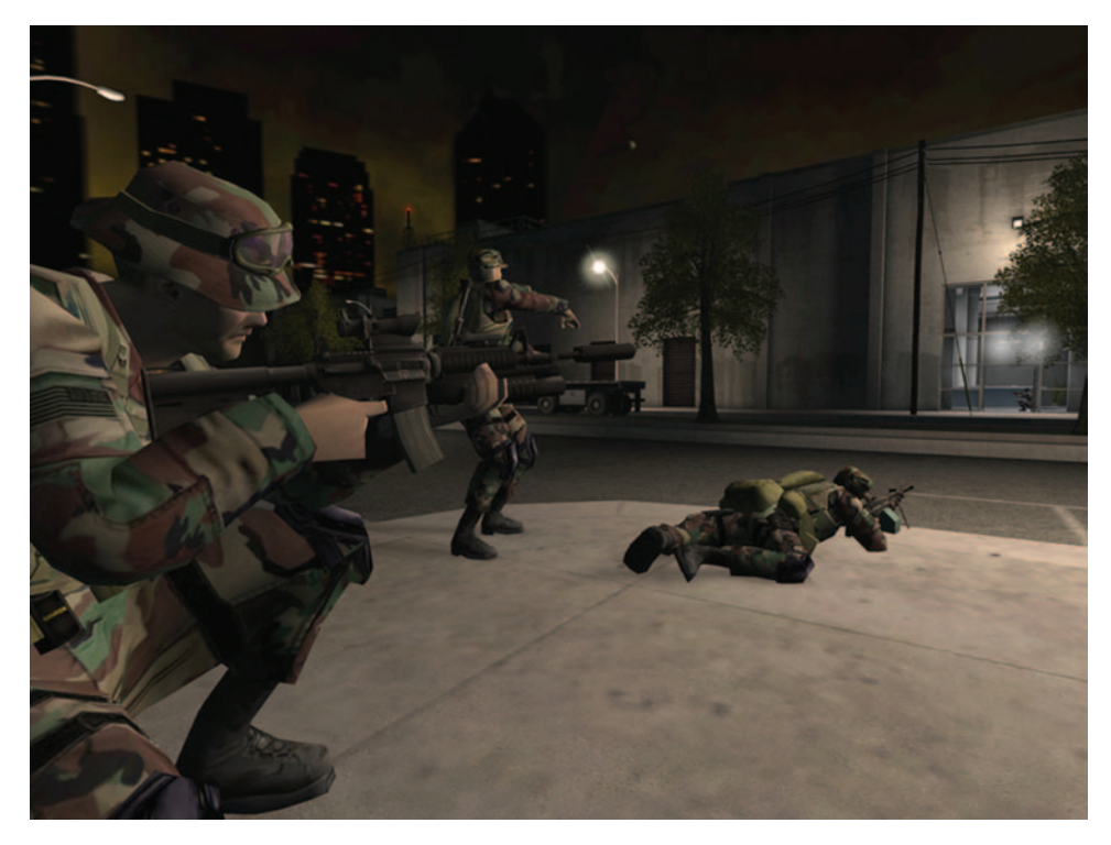
Figure 4 America's Army , a high production value simulation of life in the U.S. Army, meant for recruiting and public relations.

game's basic rifle marksmanship and combat training (BCT), a necessary step before gaining access to combat missions. ^{33}