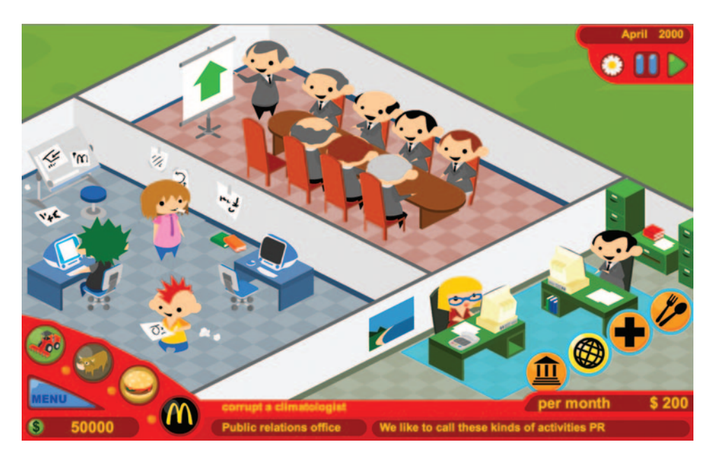
Figure 2 Molleindustria's McDonald's Videogame makes a procedural argument about the business ethics of fast food. Here, the player manages corporate communications.

the mechanical and professional rules of aviation work. But since procedurality is a symbolic medium rather than a material one, procedural rhetorics can also make arguments about conceptual systems, like the model of consumer capitalism in Animal Crossing . Gee argues that modeling allows "specific aspects of experience to be interrogated and used for problem solving in ways that lead from concreteness to abstraction." Games like Animal Crossing demonstrate that such models include, but extend far beyond physical and formal models to include, arguments about how social, cultural, and political processes work as well.