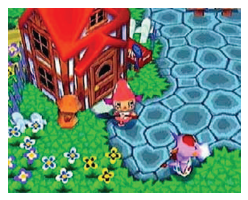
Figure 1 A player near her house in Animal Crossing . While it looks like just an idyllic cartoon world, the game also models commerce and debt.

In real life, when we pay our mortgage bill we don't see where that money ends up. But in Animal Crossing , the player experiences the way his debt makes bankers wealthy. After a player makes a major payment to his mortgage, Tom Nook closes his shop and upgrades it; the game starts with Nook's Cranny, a wooden shack general store, and ends with Nookington's, a two-story department store. Each upgrade allows Tom Nook to sell more goods. None of the townsfolk ever appear in Tom Nook's shop, although they occasionally refer to it somewhat disdainfully; the animals seem to have little drive to consume. Animal Crossing's nonplayer characters (NPCs) are much less materialistic. The cute animals that occupy the village sternly berate the player if they haven't seen him around for many days, but they seem to have no concern for the quantity or type of material properties that the players possess. Occasionally, animals will express desire for a shirt or furniture item the player carries with him around the village, and they will offer to trade for it. But this type of transaction is both rare and charming; the animals frame their requests in terms of inveterate longing—"I've always wanted a Modern Lamp!"—quite a different refrain from the mallgoer's "one overriding interest, to spend money."